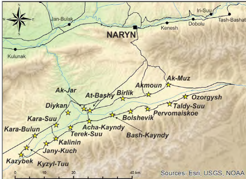
Figure 1. Study area and selected villages

In each sampled household we interviewed the household head and his wife in order to reflect the main decision makers' views. Data were collected in the study area between February and July 2014. Quantitative farm-level data on the organization and economic performance of smallholder farms were collected by structured questionnaire. The interviewees were asked to provide information on the agricultural production systems, the level and type of mechanization used, resource base (including human, livestock, land, and capital resources), debt status, family-household economy, off-farm activities, and the social status of the family.